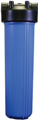
20" Big Blue Housings