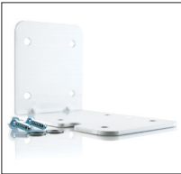
Bracket and Screws