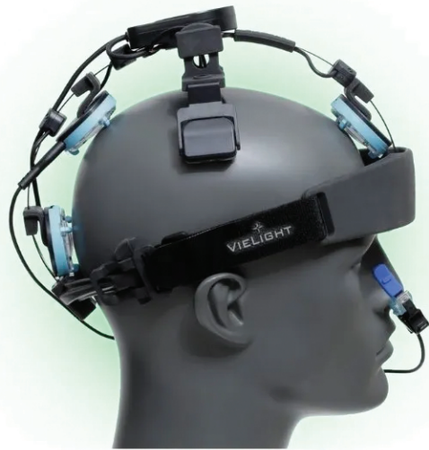
patented transcranial-intranasal design