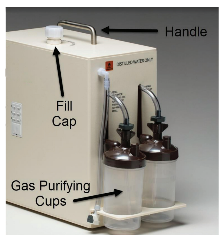
• Threaded Fill Cap • Gas Purifier Cups • Carrying Handle